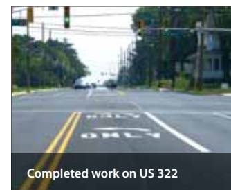
Completed work on US 322

In 2008, with a $16 million commitment from NJDOT and a $10 million investment from the County, the Gloucester County Freeholders put shovels in the ground and began to remedy the traffic conditions that forced motorists