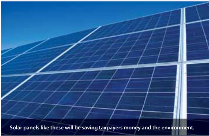
Solar panels like these will be saving taxpayers money and the environment.